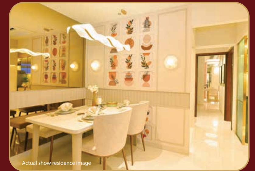
Actual show residence image