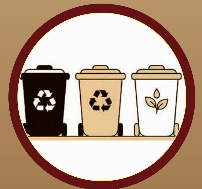
Waste management systems