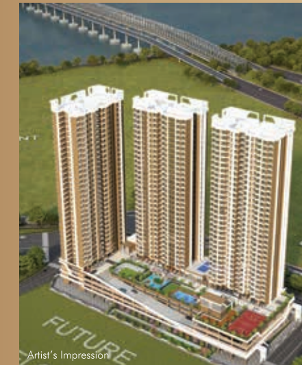
DOSTI TULIP AT DOSTI WEST COUNTY THANE (W)