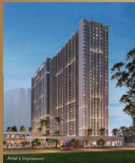
DOSTI MAPLE AT DOSTI WEST COUNTY THANE (W)