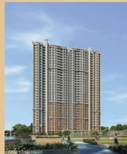
DOSTI OLIVE AT DOSTI WEST COUNTY THANE (W)