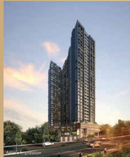
DOSTI MEZZO 22 SION