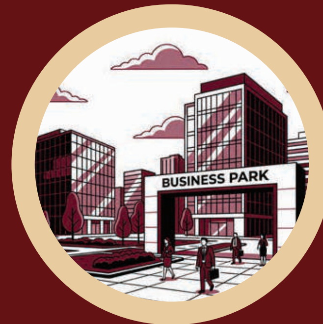
Proximity to key IT and corporate parks