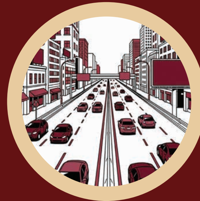
Swift access to the Eastern Express Highway, LBS Marg and arterial highways