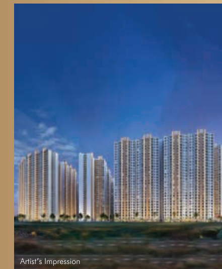
DOSTI GREATER THANE KALHER