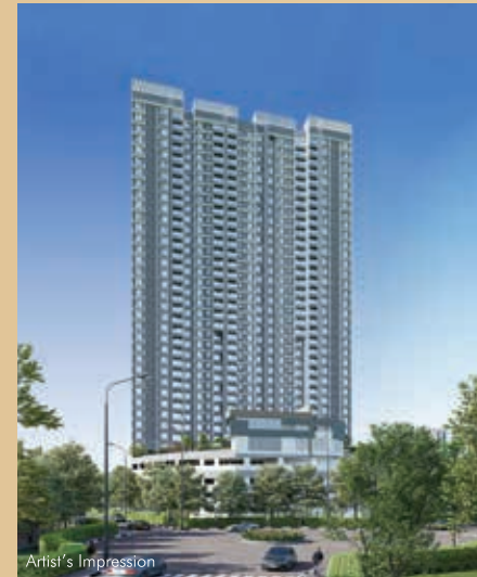
DOSTI EDEN AT DOSTI DESIRE, PHASE 2 THANE (W)