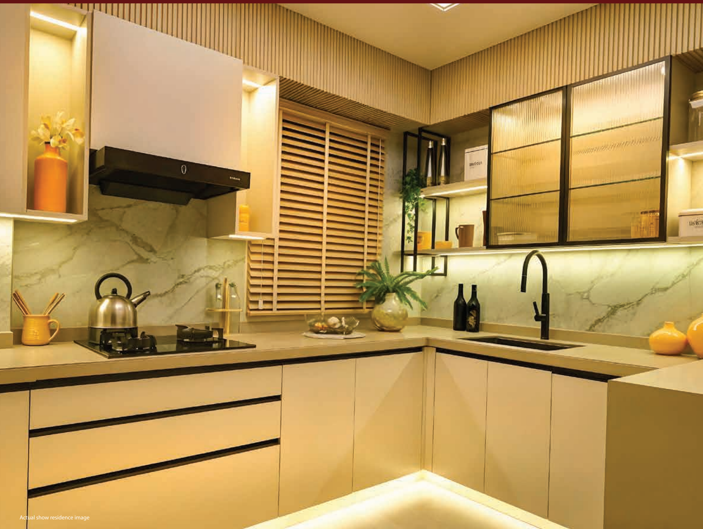
Actual show residence image