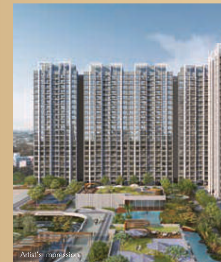
DOSTI GREENSCAPES PUNE