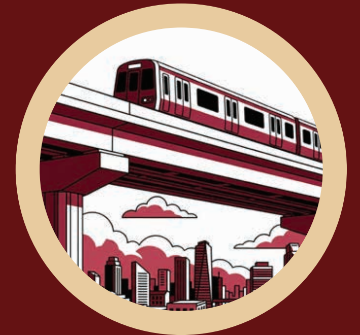
Upcoming Metro & Ring Metro connectivity