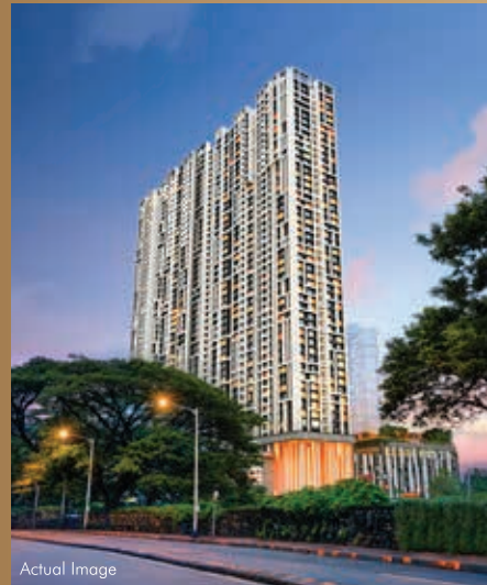
DOSTI EASTERN BAY WADALA