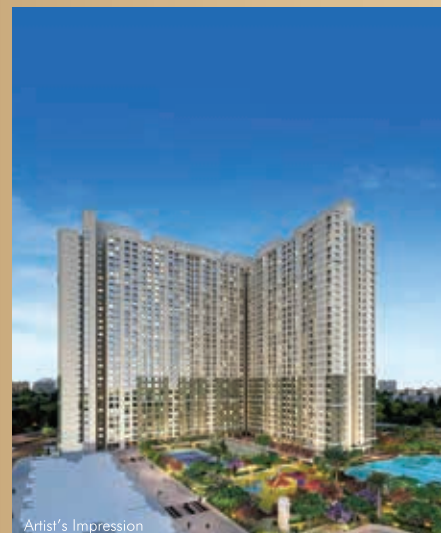
DOSTI PINE AT DOSTI WEST COUNTY THANE (W)