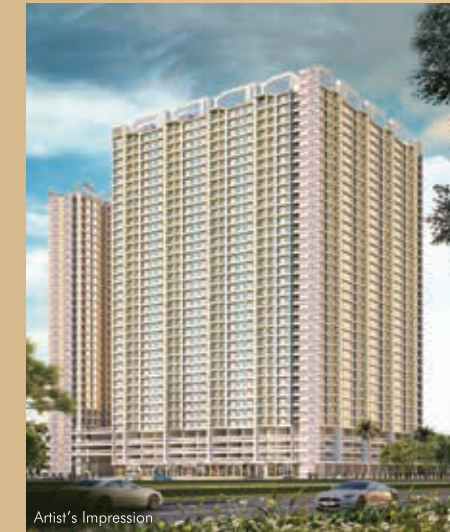
DOSTI NEST AT DOSTI WEST COUNTY THANE (W)