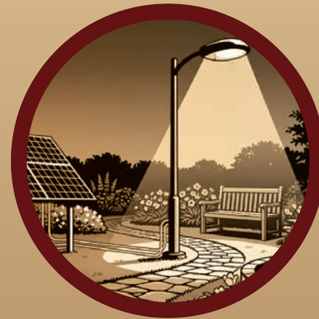
Solar-powered common areas

Sustainability is seamlessly woven into everyday living through conscious design choices, efficient systems, and eco-sensitive planning that supports a healthier tomorrow.