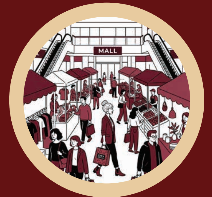
Close to hospitals, malls, markets and lifestyle hubs